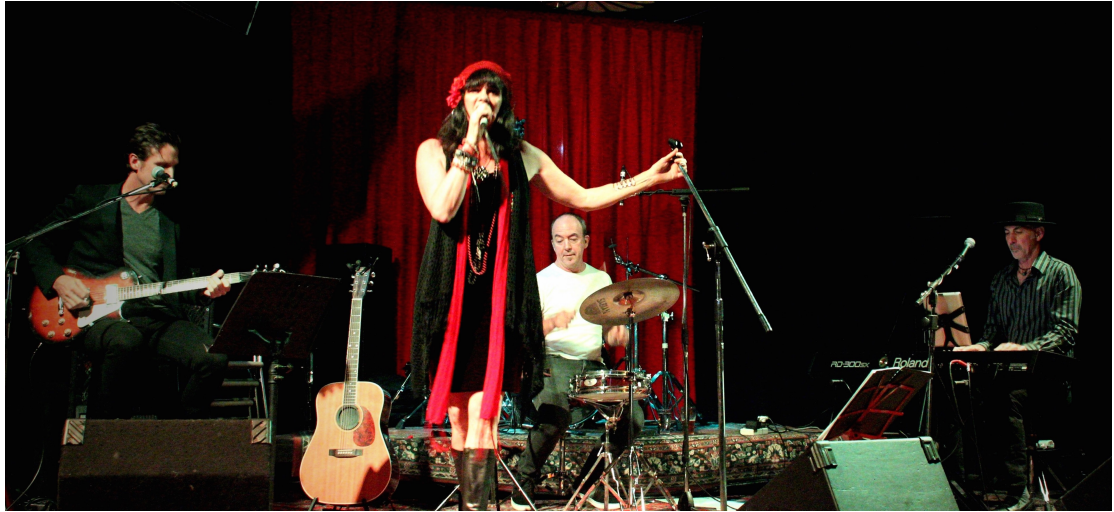
Smaller show with and without imagery